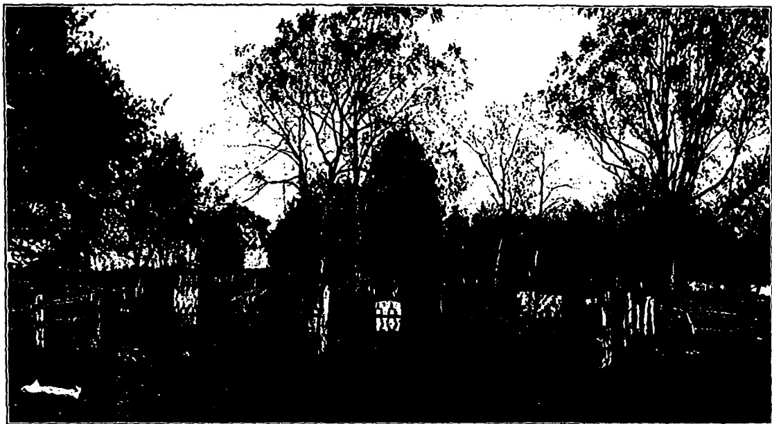
OLD RUNKLE BURYING GROUND, NEAR ANNANDALE.