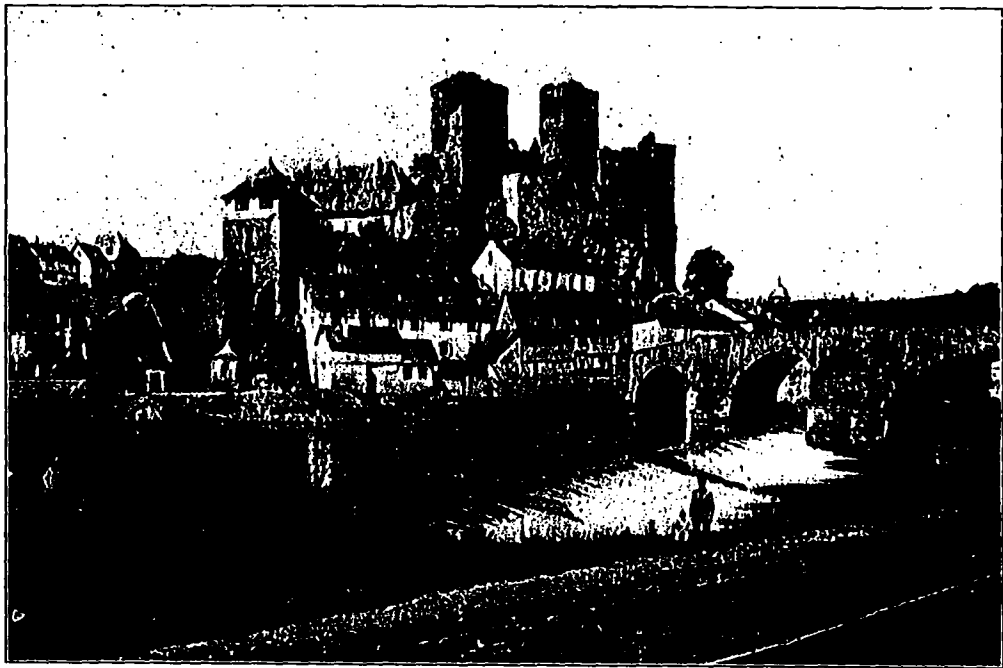
CASTLE OF RUNKEL, ON THE LAHN, GERMANY.