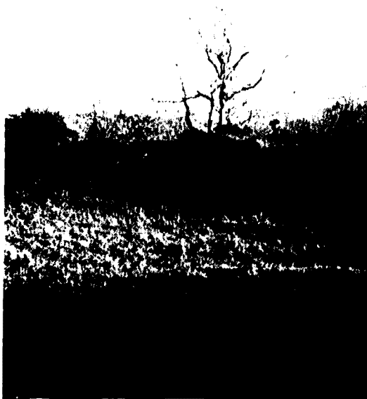
Portion of earthen rampart, Lismoyle Fort. Original Bolton house was near by.