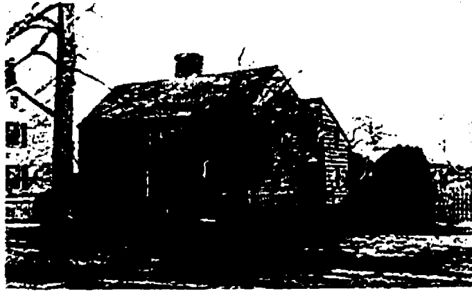
HOME OF GLORIANNA s (FOLSOM) STIRLING (54) STRATFORD, CONNECTICUT