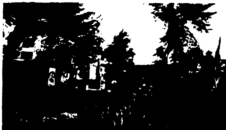
A CORNER OF THE FOLSOM CEMETERY FIRST BURIAL, LIEUT. PETER 2 FOLSOM, 1717 ON ESTATE OF WENDELL BURT FOLSOM