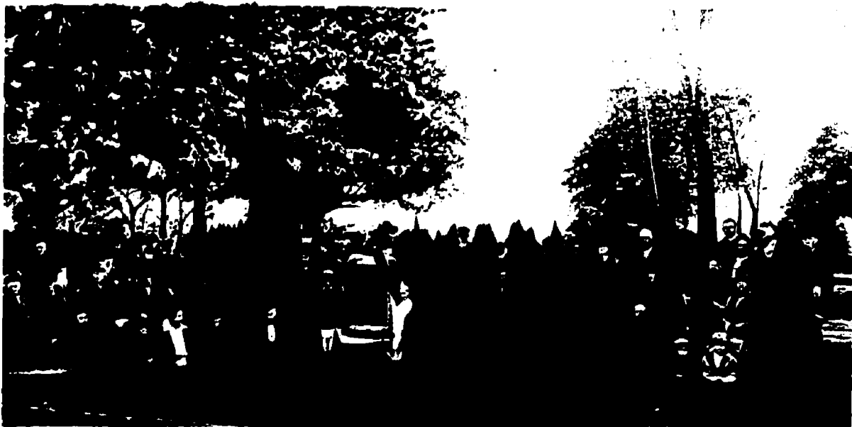
FOLSONS AT UNVEILING EXERCISES, EXETER, N. H., SEPTEMBER 30, 1916