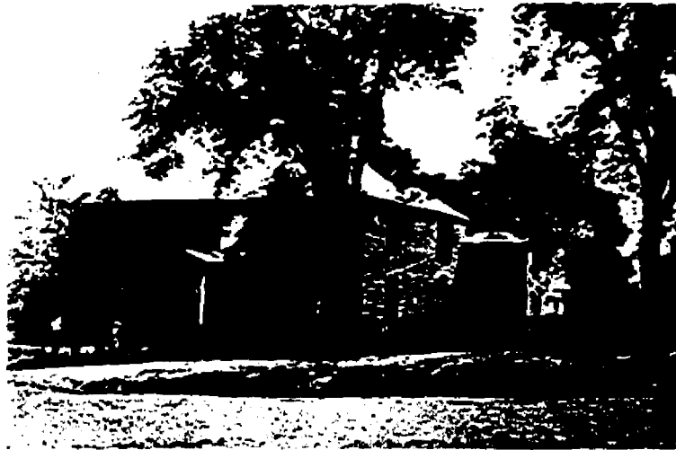
TAVERN OF COL. SAMUEL l FOLSOM (28) AS ORIGINALLY BUILT ABOUT 1787